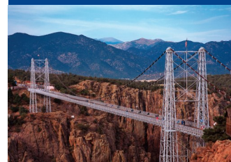
Visit to the Royal Gorge Bridge and Park