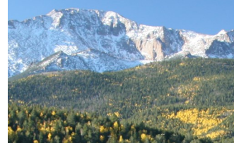
Famous Pikes Peak - America's Mountain